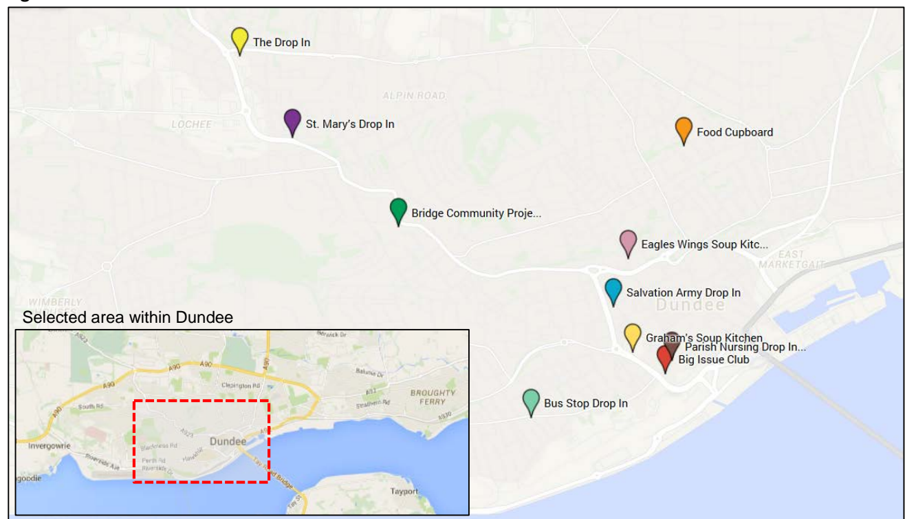
Figure - Distribution of DDI services in Dundee

One aspect identified in the survey is the concentration of DDI services in a specific geographic area of Dundee that surrounds the City Centre, spreading over DD1, DD2 and DD3 neighbourhoods. The fact most DDI users live in these areas may reflect the limited geographic reach of DDI services that tend to be localised. It indeed cannot be seen as a negative aspect of the services. In fact, the 'local' reach results in a good connection with local communities as we could observe during some visits and talks with DDI members and service users. In any case, parts of DD3 and the DD4 areas may be a 'frontier' to set up new DDI type services in support of people in poverty as reflects the Scottish Index for Multi-Deprivation (SIMD) for Dundee. At the time of reporting it is understood that a similar type of services have started in Whitfield (North East Ward – DD4), Stobswell (Maryfield Ward – DD3/4) and St. Mary's (North West Ward – DD3). In all cases these locations are developments in areas without any DDI type service.